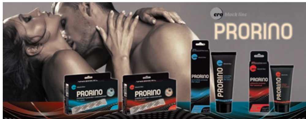
Prorino is one of the most popular lines at HOT

■ We will use the exhibition to increase the popularity of the HOT brand, and of course to explain our philosophy and products. We do the same everywhere in the world, so there is no special show for Asia or Africa.